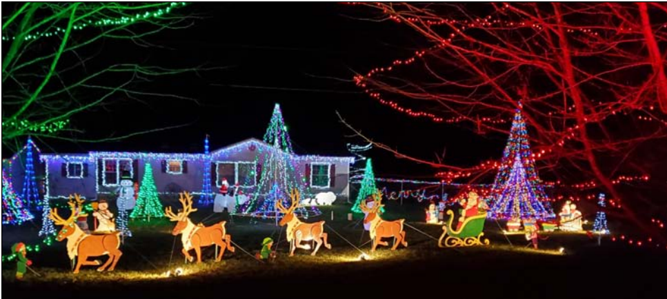
8295 W. Simpson Rd., Ovid. Drive by, enjoy and donate.