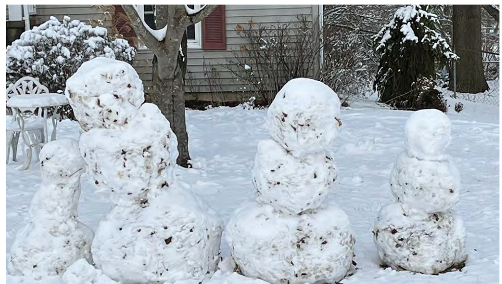
AFTER AN EXTREMELY MILD JANUARY, The Weekly got its first sighting of a snowman on Thursday afternoon ... after a moderate snow finally hit mid-Michigan on January 25. This wasn't just a snowman, either; it was an entire snow family crafted at 6589 Westview Dr. near Lake Victoria.