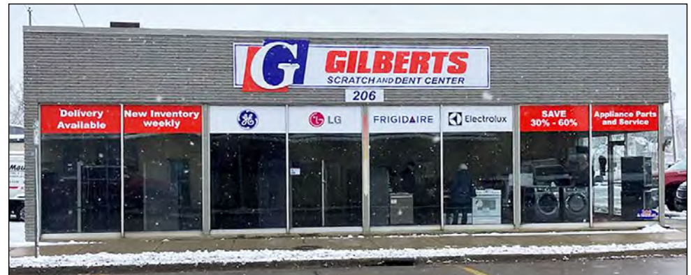
Gilberts Opens Scratch and Dent Center: The former Reeves Wheel Alignment building located at 206 S. Water Street in Owosso now houses another option for Gilberts Hardware customers, a Scratch and Dent store which will offer cosmetically damaged appliances at reduced prices. The hardware store has always offered scratch and dent appliances and now has the opportunity to work directly with GE to get those slightly blemished items in truckloads which will give customers more stock to choose from. The store is open daily from 9am-5:30pm. Stop in and take a look.