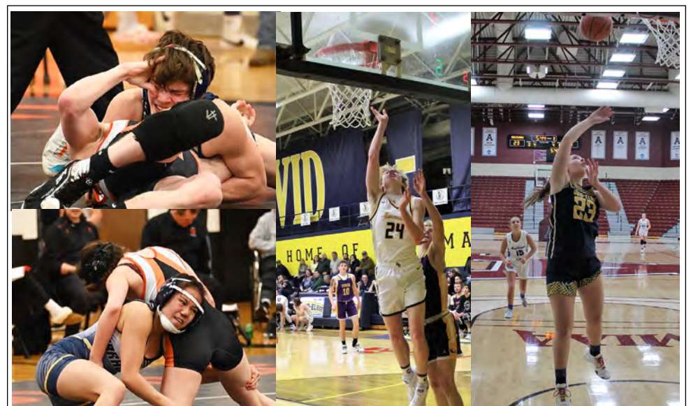
See pages 7, 8, 9, 10 for all sports results and photos