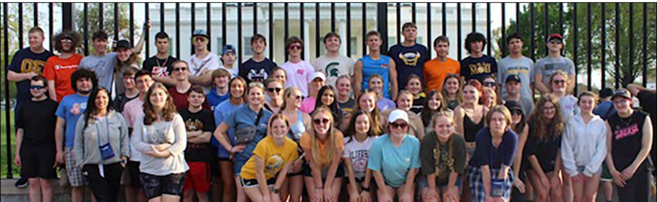
A group shot of OEHS students in front of The White House.