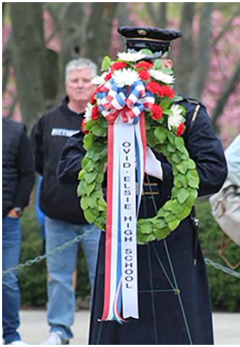
The Ovid-Elsie High School wreath at the Tomb of the Unknown Soldier