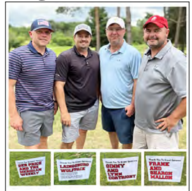
Last years winners of the golf outing.