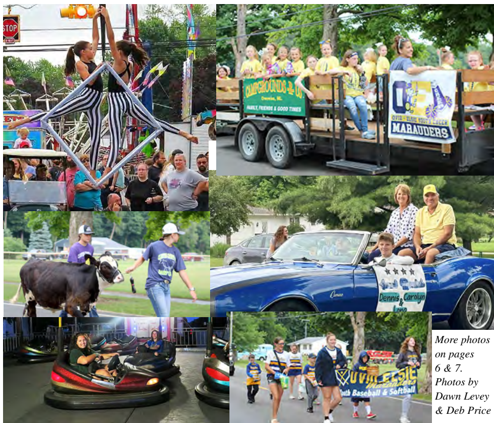
More photos on pages 6 & 7.