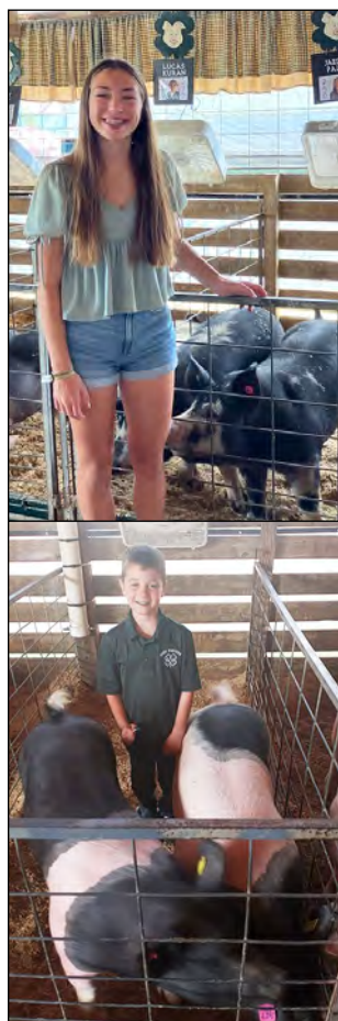
See more Shiawassee County Fair memory photos on page 7