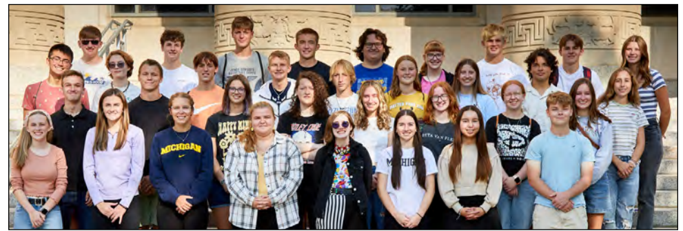
Thirty-four of the most academically accomplished high school seniors from all ten high schools in the Shiawassee County area recently made a trip to Ann Arbor. (See below for the full listing of all forty-nine nominees, which includes those nominees unable to attend the trip.)