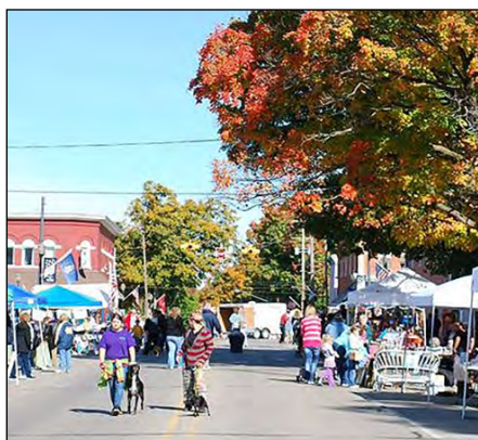
Last years event had vendors lining the streets on a beautiful fall day.