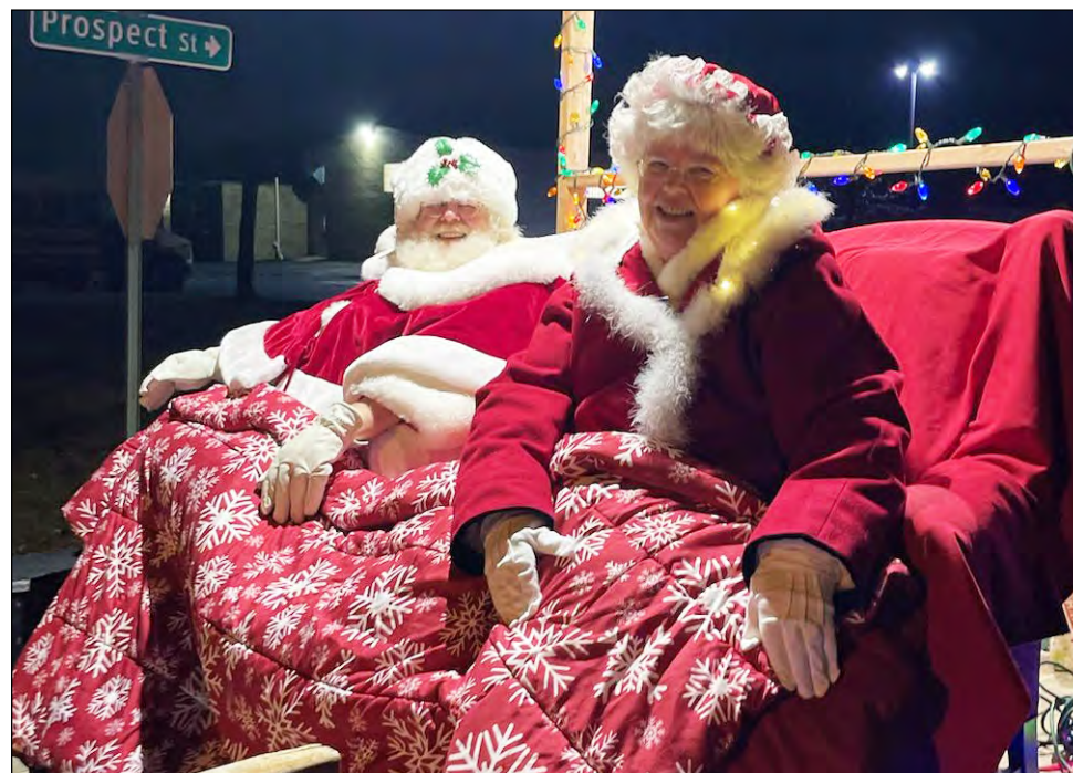
Winterfest Week in Laingsburg was held Nov.26th-Dec3rd. The popular light parade was held on Saturday, Dec 2nd. Pictured here were the stars of the parade, Santa and Mrs. Claus. Events during the week included 5K run, decorating contests, food drive, story time and Community Singers Concert. See page 12 for more photos and results.