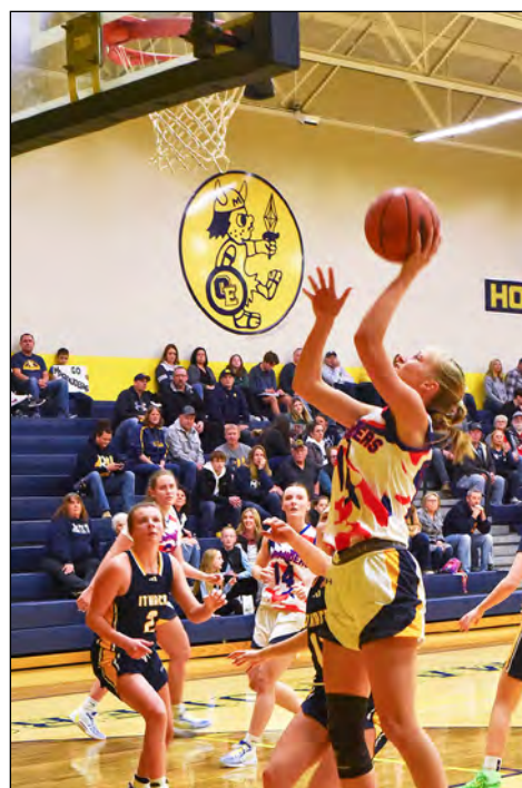
High school winter sports have begun! See pages 7-8-9 for more results and photos.