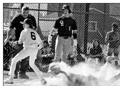
OE slides into a win against Dansville