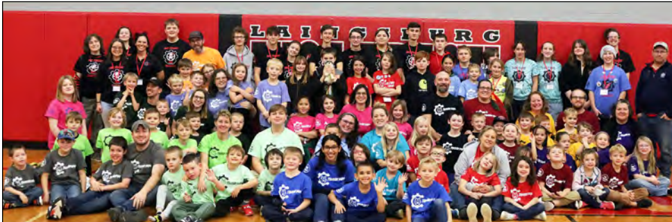
More than 100 K-12 students participated in Saturday's festival. Robotics students in grades 4-12 served as volunteers.