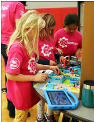
Laingsburg's program encourages young girls to pursue STEM and robotics and features several all-girl teams in grades K-8.

This past Saturday marked a grand finale of their efforts at the FIRST LEGO League Festival, hosted at Laingsburg High School. The teams, their mentors, parents, and community members came together to celebrate the hard work of these young minds. Laingsburg also welcomed robotics teams from Bath School District, making the event a collaborative and inspiring gathering.