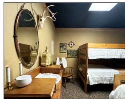
One of the seven rooms located in the Ovid Inn