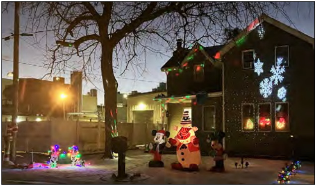
217 West St., Ovid