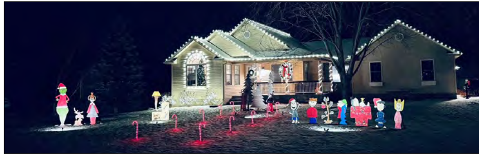
745 West St., Laingsburg