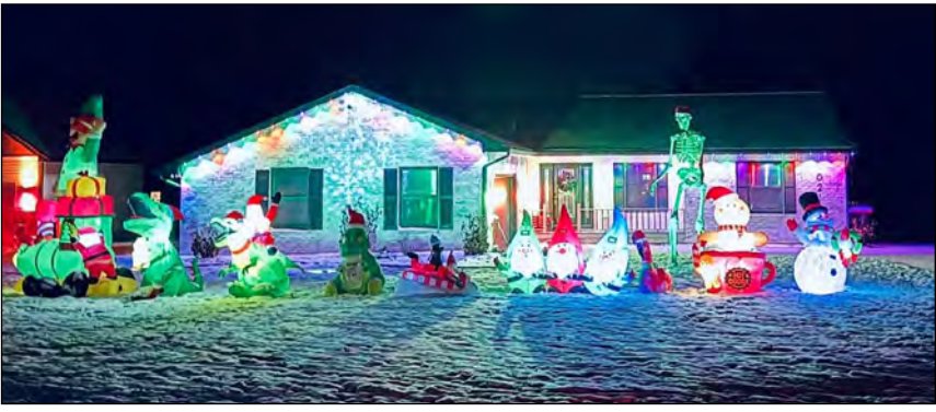
10213 South Bay Dr., Laingsburg