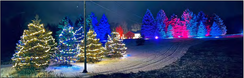
4120 Putnam Rd., Laingsburg