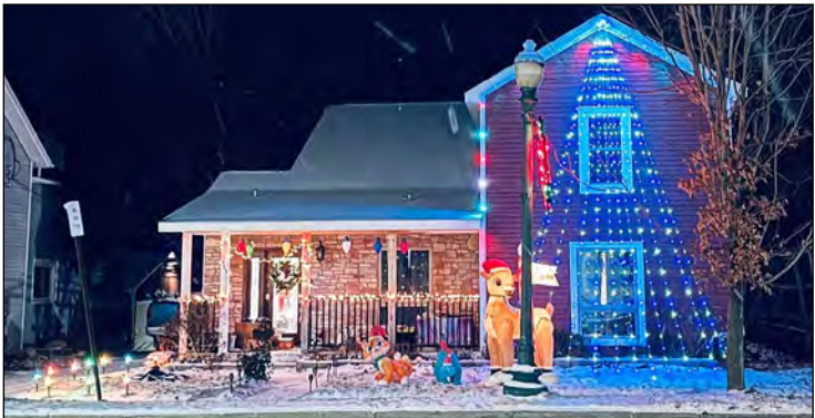
315 E. Grand River, Laingsburg