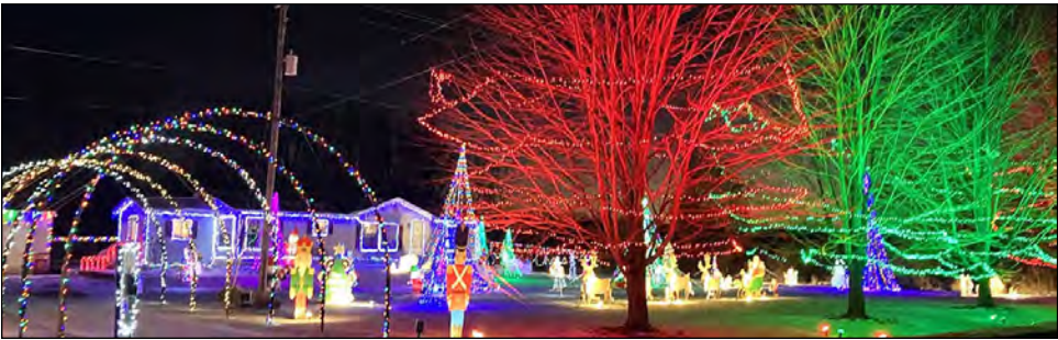
8295 W. Simpson Rd., Ovid