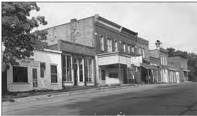
Looking east, north side: Far left library/Bolles Jeweler. Center: (wood canopy) Elite Theatre. Building (with tower) City Hall/Fire Station. Far right: Norton-Barnes Hotel.

They would love to see you visit and help celebrate on Monday, January 27.