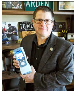
Rep. BeGole holding the newest technology for oral fluid screening for drivers.

In 2016, Michigan instituted landmark pilot programs that authorized law enforcement to use oral fluid screening during roadside stops to identify drug-impaired drivers. Data collected supported the use of this technology, and showed it was easy to use, reliable and accurate for the purposes of preliminary roadside testing. As police continue to examine ways and look for tools for how to identify drivers who may be under the influence of drugs, other states have established their own programs or proposed legislation modeled on what Michigan did. Over 20 states have oral fluid authorization written into law. The National Transportation Safety Board has recommended that Michigan make this type of testing permanent to address a significant, nationwide public safety issue.