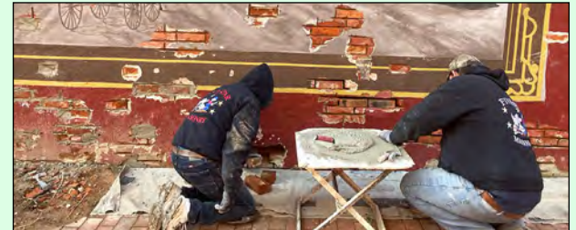
Five Star Masonry working on the Boyer Park project

For more on dams and dam management in Michigan, visit Michigan.gov/DamSafety .