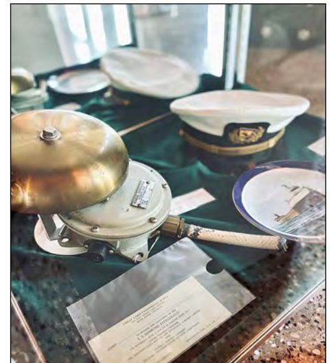
Photo from the Great Lakes Shipwreck Exhibit displayed at the IQ Hub in St Johns.

The IQhub is a 501(c) 3 non-profit organization with a mission to educate the public, while bridging the gap between agricultural producers and consumers, using interactive displays and presentations.