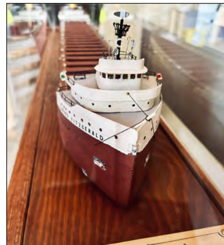
Photo from the Great Lakes Shipwreck Exhibit displayed at the IQ Hub in St Johns.

See page 12 for information on the 61st Annual Pancake Breakfast and Classic Car Show on Saturday, July 26th in Laingsburg